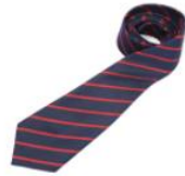
Hale School Tie