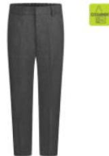
Boys Grey School Trousers with Waist Adjuster by Zeco