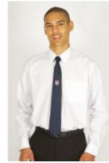
Pack of 2 Long Sleeve Polycotton Easycare White Shirts by Trutex