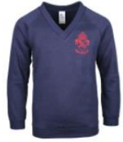
Hale V Neck Sweatshirt by Trutex