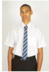
Pack of 2 Short Sleeve Polycotton Easycare White Shirts by Trutex