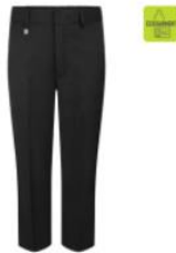
Boys Elastic Back Pull Up Grey School Trousers by Zeco