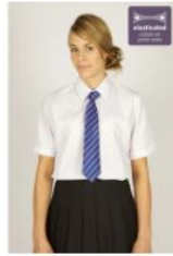
Pack of 2 Short Sleeve Polycotton Easycare White Blouses by Trutex