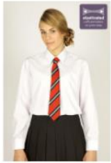
Pack of 2 Long Sleeve Polycotton Easycare White Blouses by Trutex