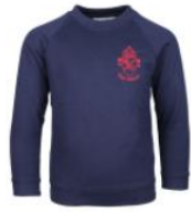
Hale Round Neck Sweatshirt by Trutex