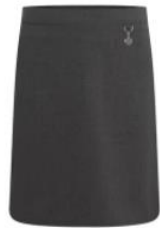
Grey Lycra Skirt with Heart Detail