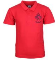
Hale Polo Shirt by Trutex