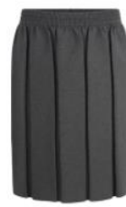
Grey Box Pleat Skirt