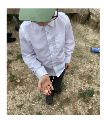
Have a lovely summer. We look forward to hearing all about it! See you soon.