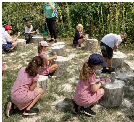
Last year's Year 3s at Butser Farm

We are looking forward to you starting Year 3 in September!