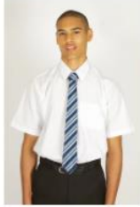
Pack of 2 Short Sleeve Polycotton Easycare White Shirts by Trutex