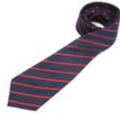
Hale School Tie